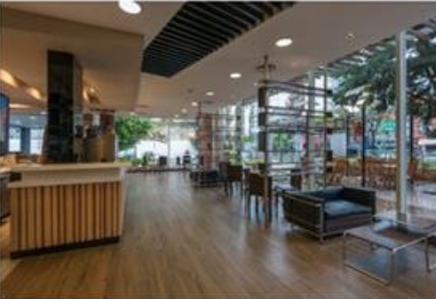
Below is an image of a Dessert Center "Ice Cube" pilot: